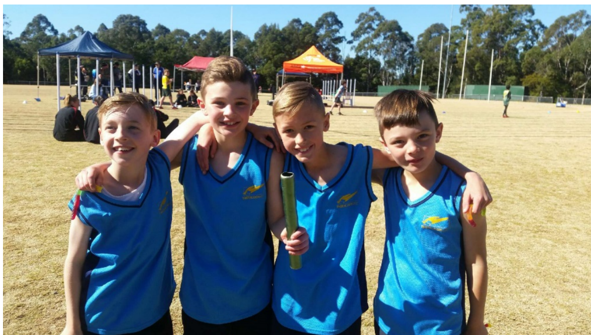
Junior Relay Team