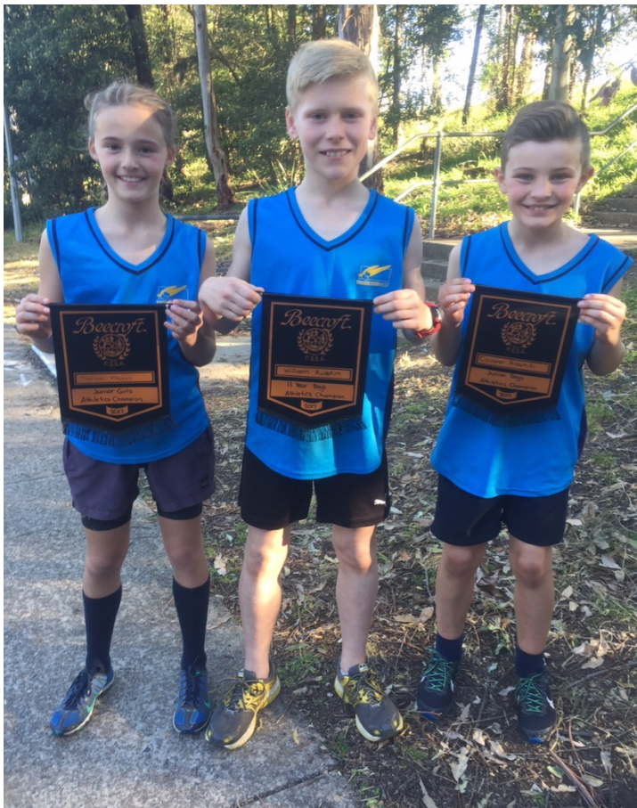
Zone Age Champions