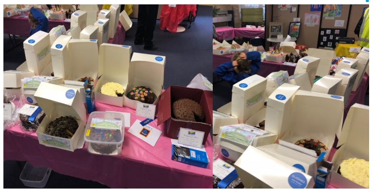
Lots and lots of chocolate cakes! (thanks for asking me to judge!!!)