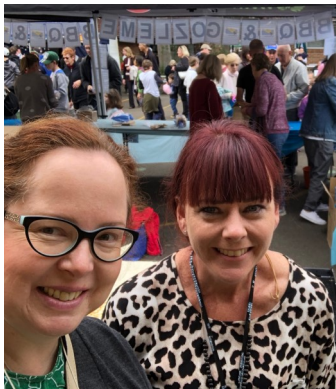
A Proud Principal and Deputy :)