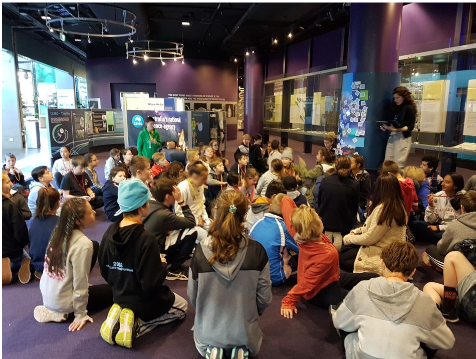
CSIRO Discovery Centre - Y6 ready for a QR code scavenger hunt.