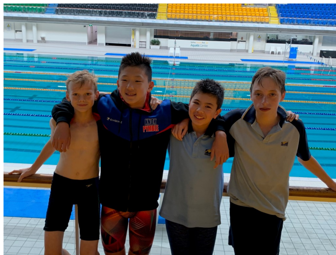
Senior Boys Relay Team—2nd Place. Well done boys!

A great day poolside for Zone swimming with all of TWPS trying their best. - Tiffany Part.