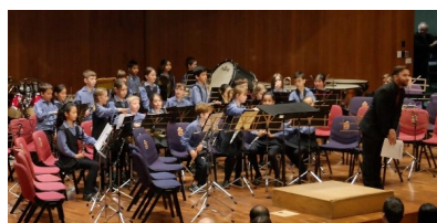
Training Band 2018