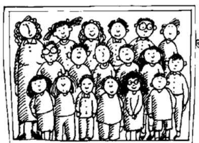
CLASS PICTURE DAY IS COMING SOON!

School photos will be taken on Monday 10 February . Order envelopes will be sent home next week and need to be returned on photo day only please . The photographer's instructions also indicate that an envelope needs to be returned separately for each child, but only if not ordering online (in that case an envelope does not need to be returned at all, please see envelope for instructions). Family photos will also be taken and order envelopes for those are available from the office on request.