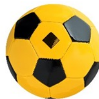
Mini Soccer Ball (size 2)

For every deposit made at school students will receive a silver Dollarmites token. Once students have individually collected 10 tokens they can redeem them for exclusive School Banking reward items, in recognition of their regular savings habits. There are two new items released each term so be sure to keep an eye out for them!